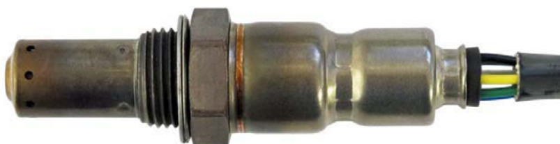
(NO x , Type T Sensor Shown)

Uses Direct-Insertion Ceramic NOx Sensor